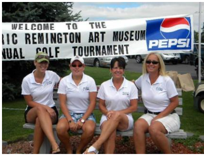
Off the Hook Bed & Breakfast and Gas & Grocery