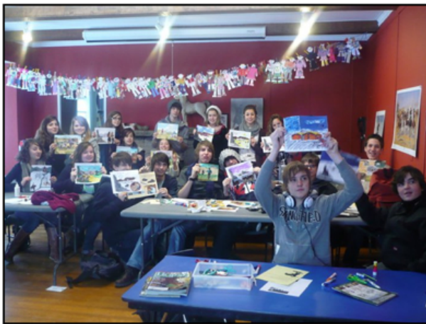
French Exchange Students

Toddler Time: Come early on a Tuesday morning in the summer to enjoy Toddler Time! Toddlers and caretakers can enjoy learning new songs, dancing, playing games and an art activity.