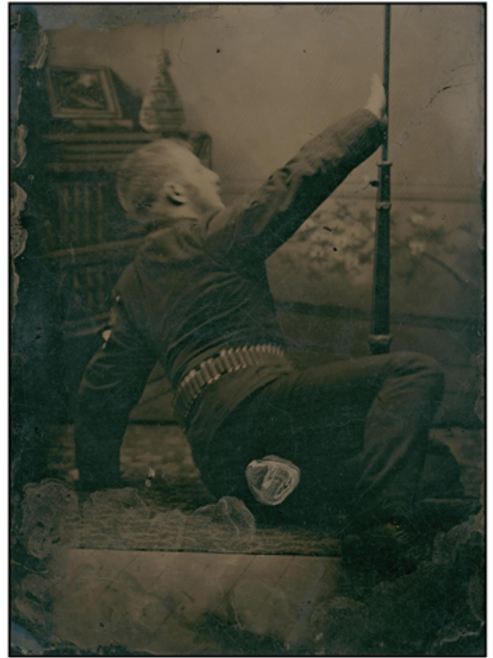
Frederic Remington Posing on the Floor