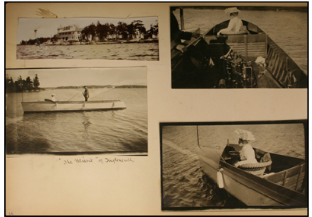
Photographs from Frederic Remington’s scrapbook.