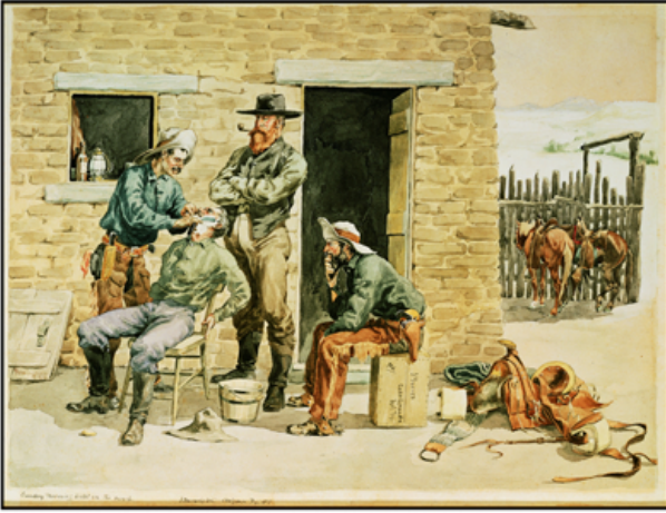
Sunday Morning Toilet on the Ranch , 1885, Frederic Remington, watercolor on paper

Ringling College of Art and Design, Selby Gallery Sarasota, Florida