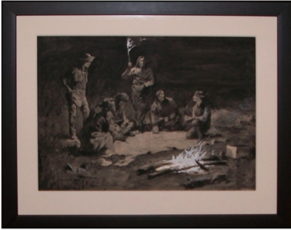
I Was Geet up un Was Look at de Leetle Man, 1898