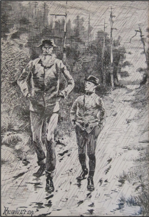
In a Sharp Scurry of Rain, 1888