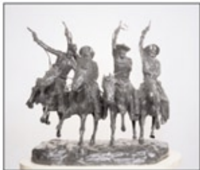
Coming Through the Rye , © October 6, 1902

Frederic Remington: Master of Diverse Media October 3, 2009 - September 17, 2010