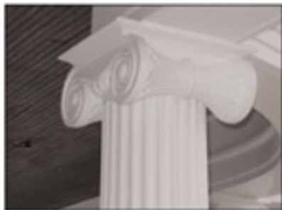
Before and after: parts of the woodwork were replaced with custom milled replicas.