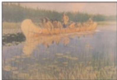
The Great Explorer IV - Railroad

"Frederic Remington Makes Tracks...Adventures and Artistic Impressions" 50 lifetime Remington prints, silver sculpture reproductions, and one sculpture of Frederic Remington.