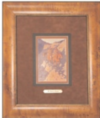
The Unknown Explorer, one of 11 different Collier's prints we offer.

Collier's Prints. We have available archivally framed Collier color prints from the years between 1904 and 1911, representing eleven different Remington paintings. These prints reflect the manner in which much of the public was first introduced to the art of Frederic Remington. Prices range from $1,095 to $2,195. In the years 2006 - 2009 thirty-four prints have sold.