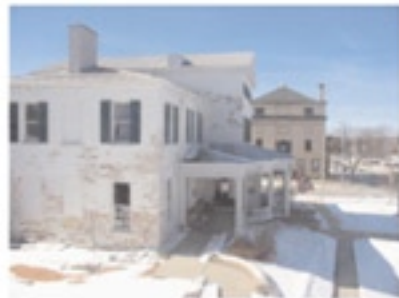
The Parish Mansion, viewed from the east, winter 2007.

Please contact the Museum if you would like to receive our Campaign materials, need further information regarding naming opportunities, or learn how you can help us reach our goal and make good things happen at the Remington Art Museum.