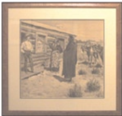
The Schoolmaster had to Bear the Brunt of Each Attack a.k.a. No Understanding, 1901