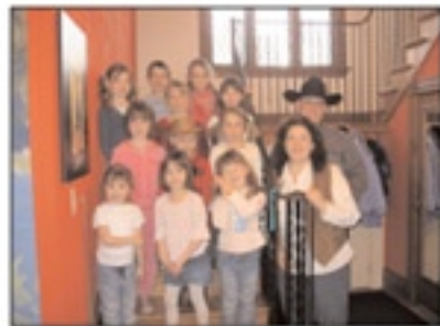
A birthday party at Kid's Place.

Ogdensburg Parks and Recreation Program. Children spent time at the museum and created a take-home project while learning about Frederic Remington.