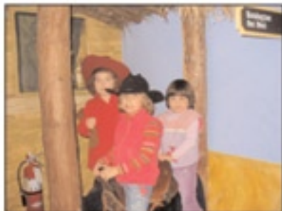
A school visit at Kid's Place.

Lunch Bunch. Pre-school children and caregivers come to Kid's Place on the second and fourth Wednesday of each month. At 11:30 AM we gather together in the classroom for lunch. The children then head to the museum for time to explore and enjoy the many exhibits. An age appropriate craft is available. Filled with happy thoughts and warm memories of new friendships, everyone is willing and ready to go home for a good nap.