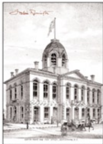
The Custom House and Post Office, Ogdensburg, N.Y. as depicted in Breen's History of St. Lawrence County , 1894.

On November 7, 2009 the Ogdensburg Post Office was renamed the Frederic Remington Post Office Building through legislation sponsored by then US Congressman John McHugh. The building was completed in 1870 as the US Custom House and Post Office, and dedicated by President US Grant in 1872. One year later Frederic Remington's father was appointed Collector of Customs to be based in this building, and the family moved to Ogdensburg from nearby Canton. It was listed in the national Historic Register in 1977, and it serves as the oldest active post office in New York State and is among the oldest in the United States.