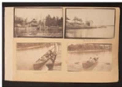
a page from Frederic Remington's Ingleneuk Island sketchbook