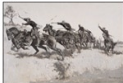
Captain Grimes's Battery Going Up El Paso Hill, 1898 Black and white oil on canvas

Captain Grimes's Battery Going Up El Paso Hill, 1898; The Outlaw, 1909; Waiting in the Moonlight, ca. 1907-1909.