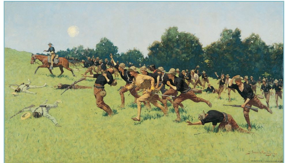
The Charge of the Rough Riders, 1898 by Frederic Remington Oil on canvas, 35 x 60" FRAM 66.52