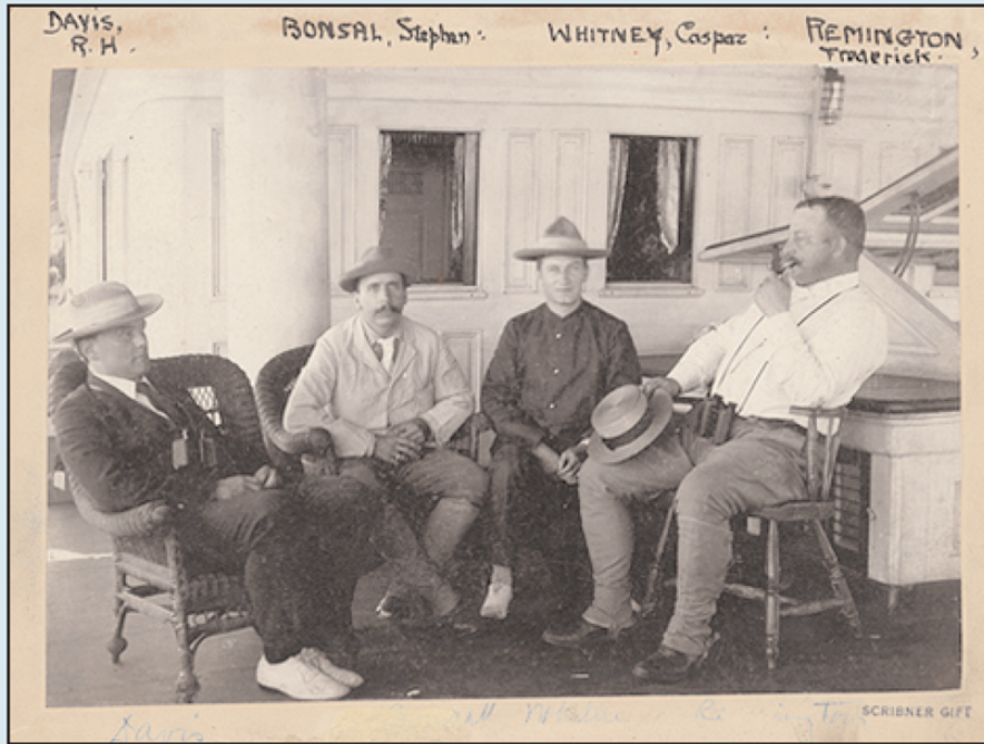
Journalists Richard Harding Davis, Stephen Bonsal, Caspar Whitney and Frederic Remington from the Charles Scribner's Sons Art Reference Department Records, Archives of American Art.

Other distance learning programming is available for art and elementary students.